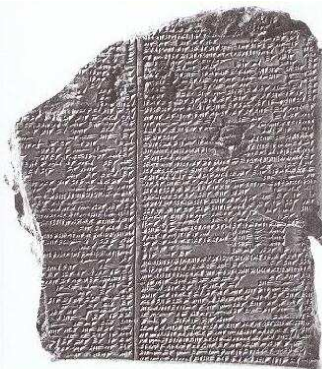
A fragment of a tablet showing the story of the flood, inscribed in Assyrian cuneiform characters.

□ Then was the launching full of difficulty; there was shifting of ballast above and below till two thirds was submerged. I loaded into her all that I had of gold and of living things, my family, my kin, the beast of the field both wild and tame, and all the craftsmen. I sent them on board, for the time that Shamash had ordained was already fulfilled when he said, "in the evening, when the rider of the storm sends down the destroying rain, enter the boat and batten her down." The time was fulfilled, the evening came, the rider of the storm sent down the rain. I looked out at the weather and it was terrible, so I too boarded the boat and battened her down. All was now complete, the battening and the caulking; so I handed the tiller to Puzur-Amurri the steersman, with the navigation and the care of the whole boat.