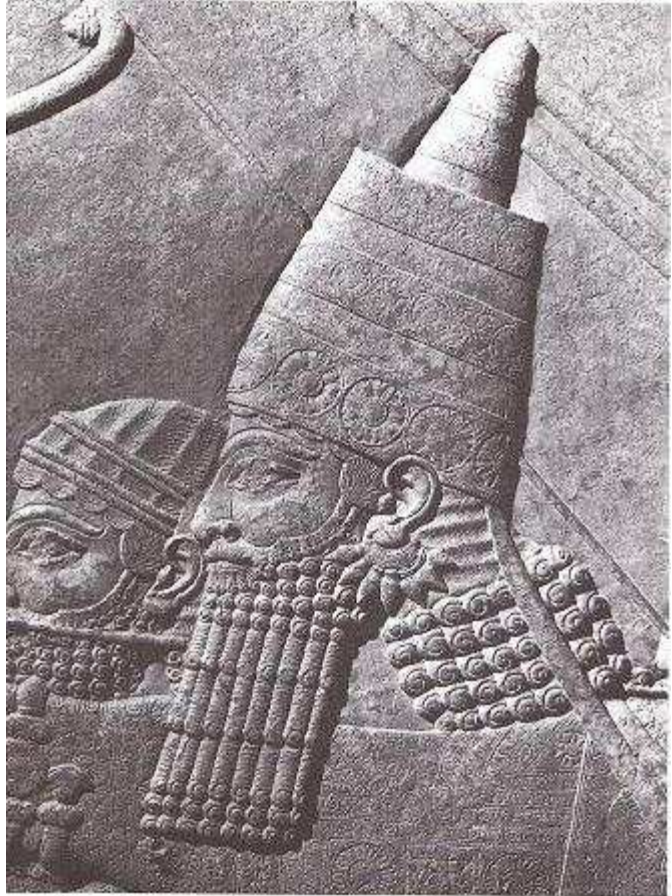
King Ashurbanipal, 669-627 B.C. The excavations of his library provided a major source of Mesopotamian literature, including a good portion of the Epic of Gilgamesh.

So the trapper set out on his journey to Uruk and addressed himself to Gilgamesh saying, 'A man unlike any other is roaming now in the pastures; he is as strong as a star from heaven and I am afraid to approach him. He helps the wild