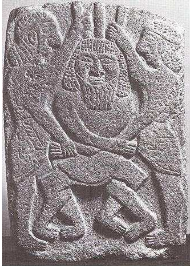
Gilgamesh and Enkidu's battle with Humbaba.

Gilgamesh replied: 'Where is the man who can clamber to heaven? Only the gods live for ever with glorious Shamash, but as for us men, our days are numbered, our occupations are a breath of wind. How is this, already you are afraid! I will go first although I am your lord, and you may safely call out, "Forward, there is nothing to fear!" Then if I fall I leave behind me a name that endures; men - will say of me, "Gilgamesh has fallen in fight with ferocious Humbaba." Long after the child has been born in my house, they will say it, and remember.' Enkidu spoke again to Gilgamesh, 'O my lord, if you will enter that country, go first to the hero Shamash, tell the Sun God, for the land is his. The country where the cedar is cut belongs to Shamash.'